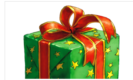
f. Measure word: 件 jiàn