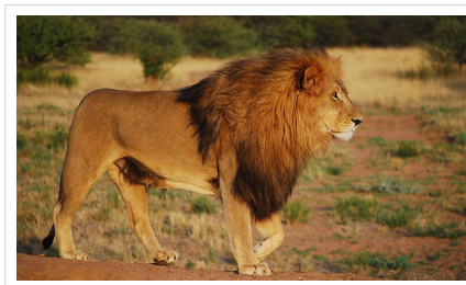
e. Measure word: 头/只 tóu/zhī