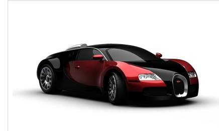
c. Measure word [ ]