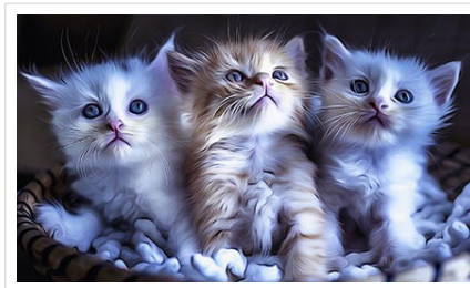
b. Measure word: 只 zhī