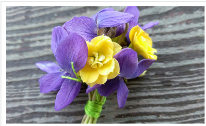
a. Measure word: 把 bǎ