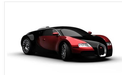
c. Measure word: 辆 liàng