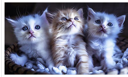
b. Measure word [ ]