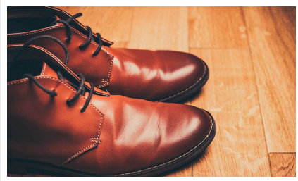
d. Measure word [ ]