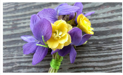
a. Measure word [ ]