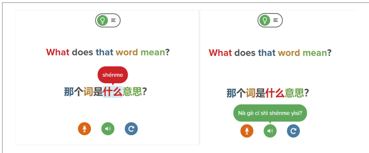
Figure 6. Phonetic transcriptions appear in bubbles at the word level (left, red) and phrase level (right, green) on all learning slides.

In addition, Mango provides phonetic transcriptions of each target language word and phrase (see Figure 6). These are specifically written so that the learner can understand the target language pronunciation from the perspective of their first language. 3