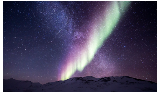
b. She has even been to the North Pole.