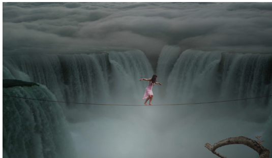
a. She is not even afraid of danger.